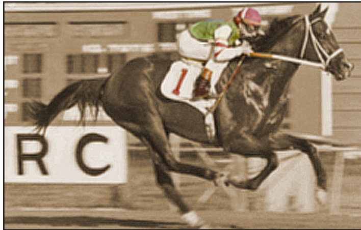
Champion My Juliet

The My Juliet Stakes was initiated in 1979 to honor another local legend. My Juliet won 24 of 36 career starts with earnings of $548,859 in a career that spanned from 1974-1977 and was named Eclipse Award as Sprinter of the year in 1976.